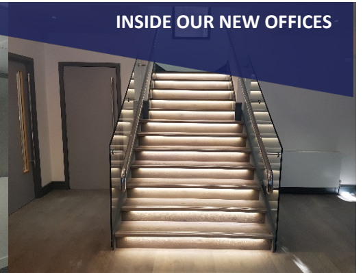
INSIDE OUR NEW OFFICES